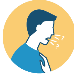
NEW LOSS OF TASTE OR SMELL