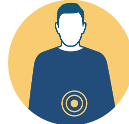
DIARRHEA, NAUSEA OR VOMITING