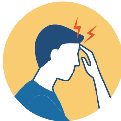
HEADACHE* *particularly new onset of severe headache, especially with fever