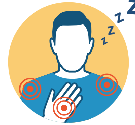
MUSCLE OR BODY ACHES OR FATIGUE