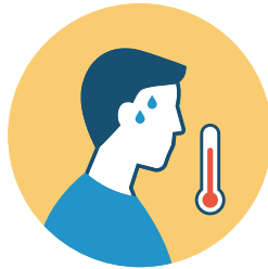
FEVER 100.4* OR CHILLS *or school board policy if threshold is lower

Every morning before you send your child to school please check for signs of illness: